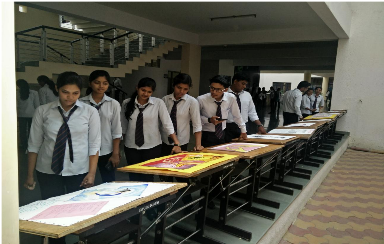
Students going through poster exhibition