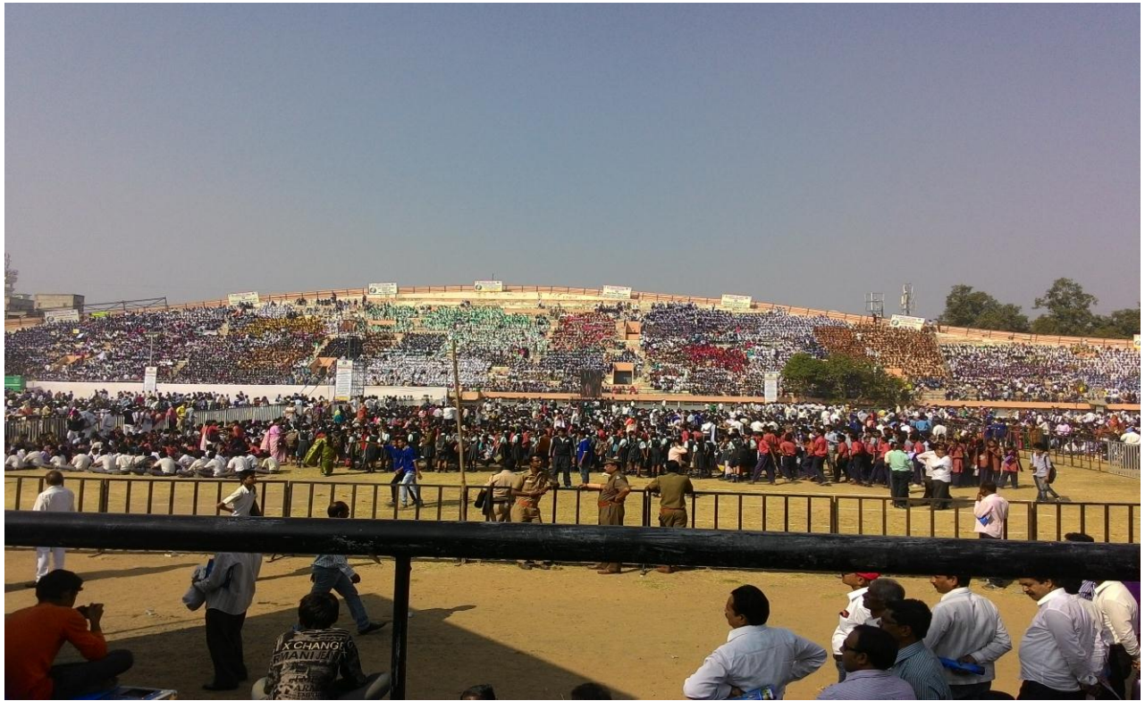
Audience gathers during Program