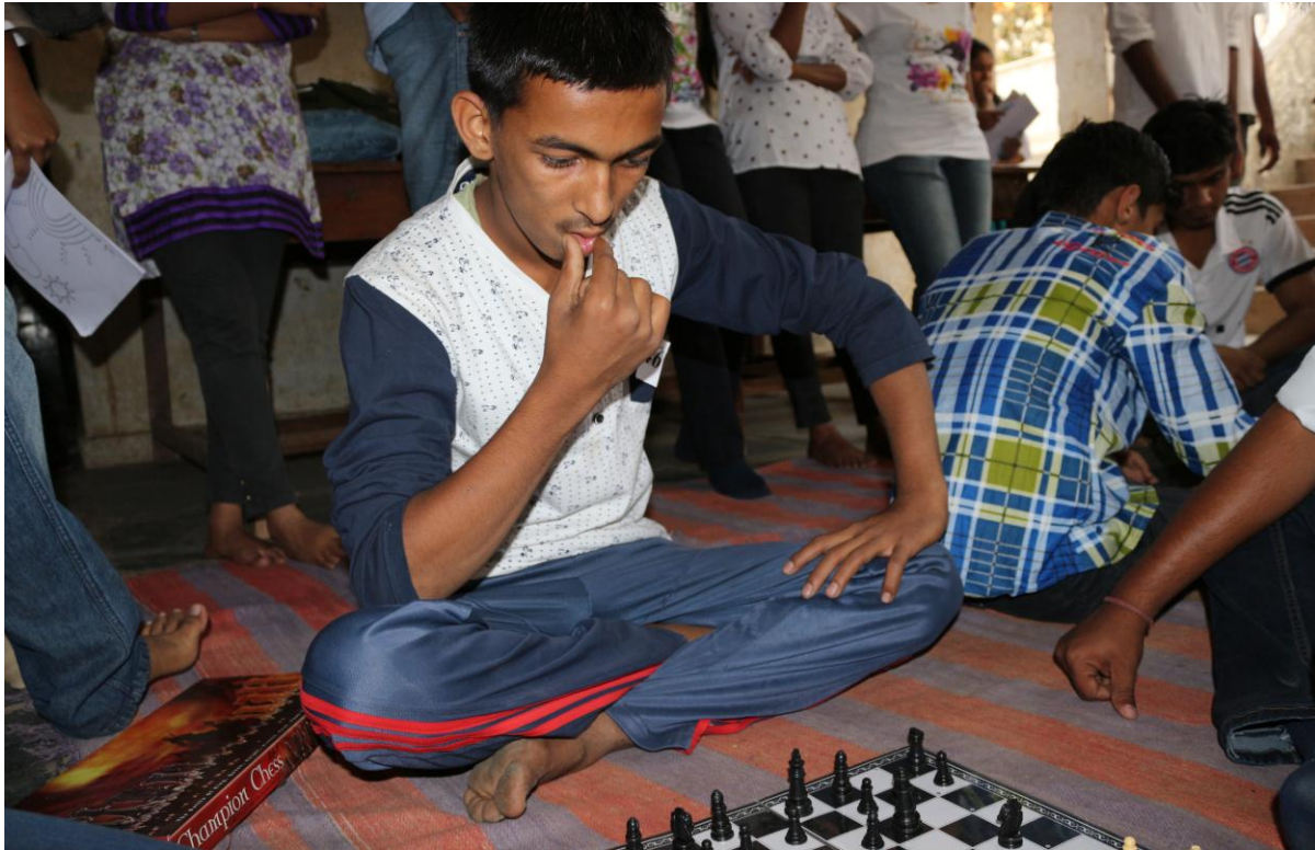
School Children Playing Chess