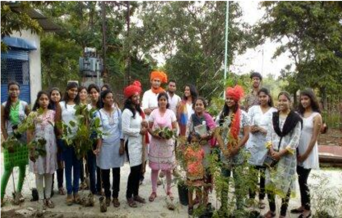
Faculty coordinators & Student Volunteers during tree plantation