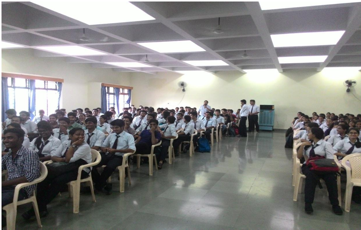
Students asking queries regarding participation and Overall concept