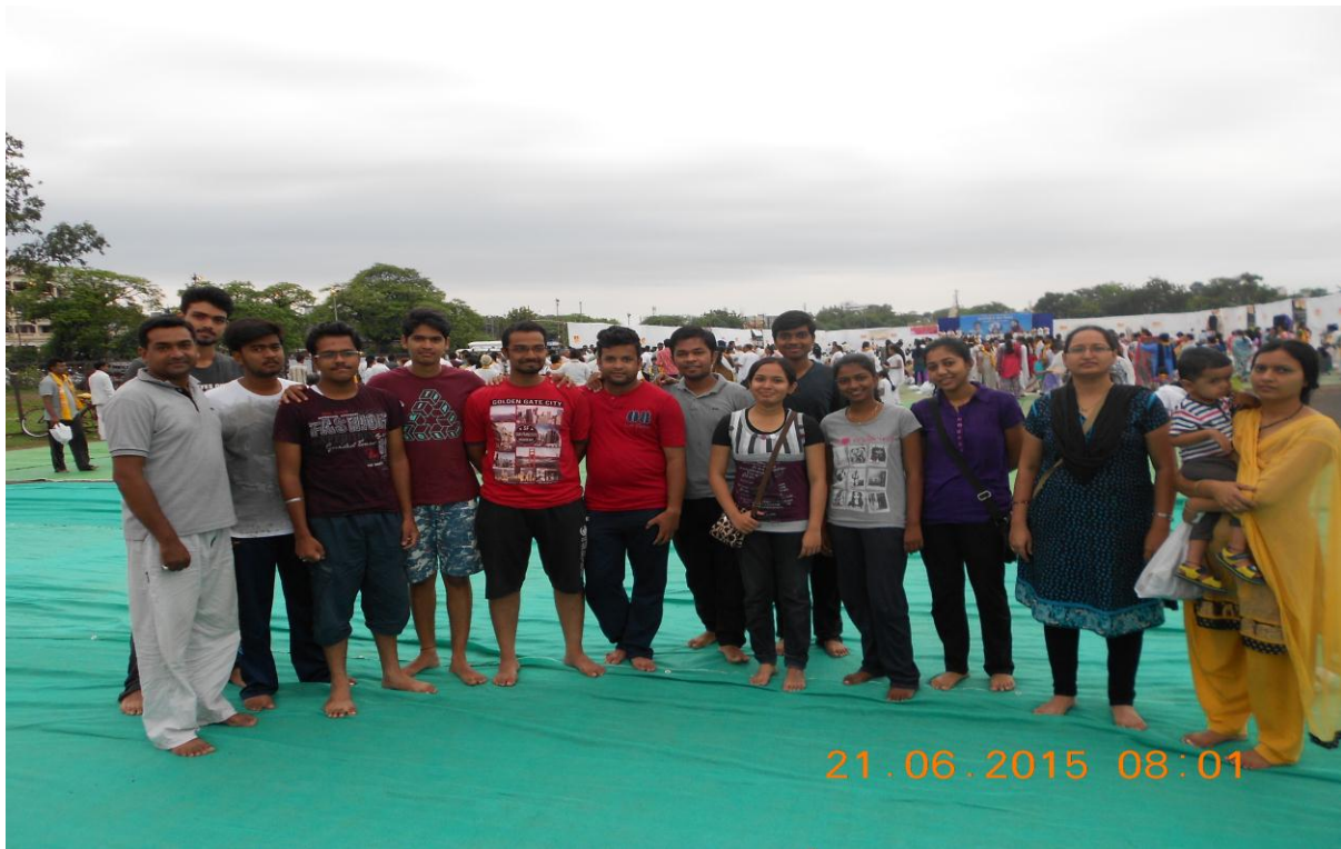
Faculties and Students after performing Yoga