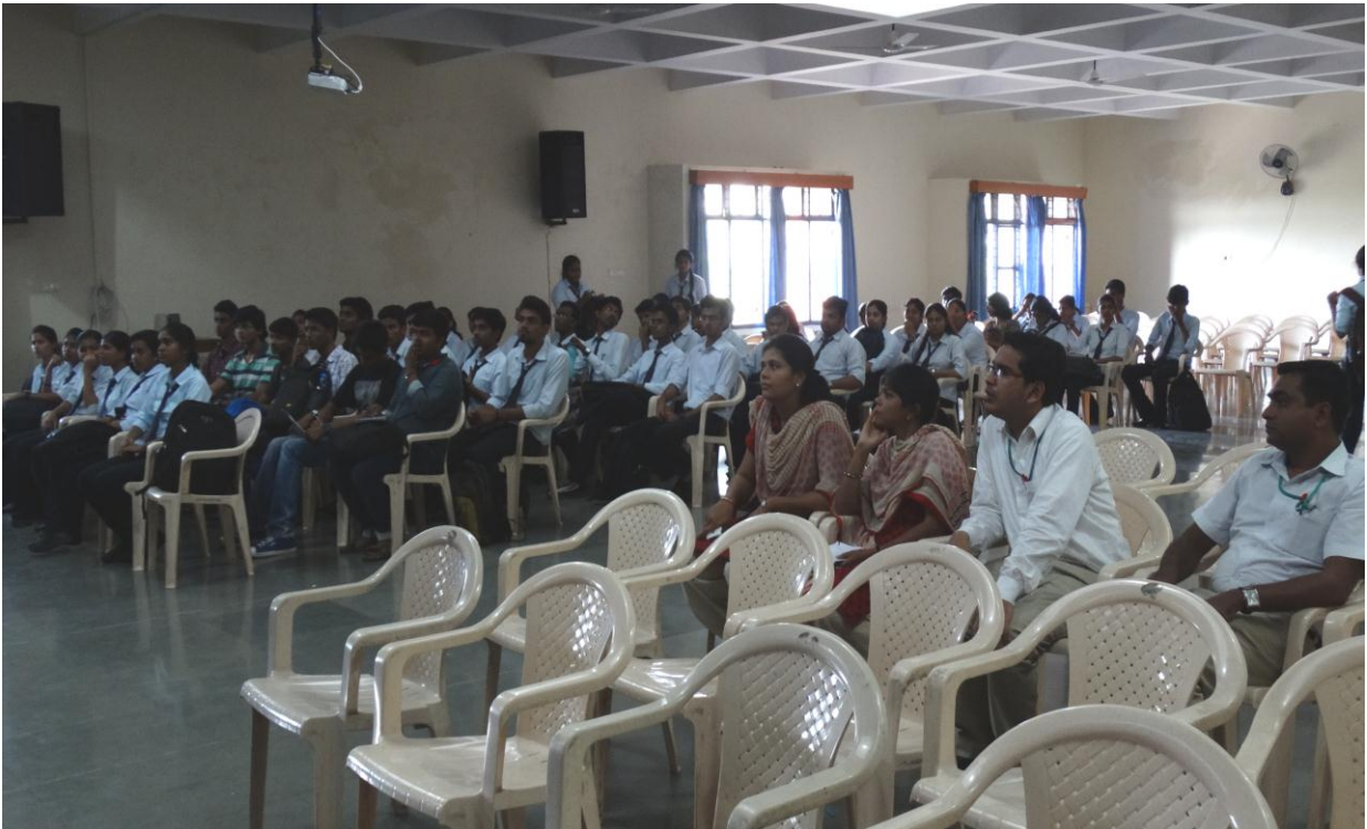
Student & Faculties gathered for Pledge taking Program