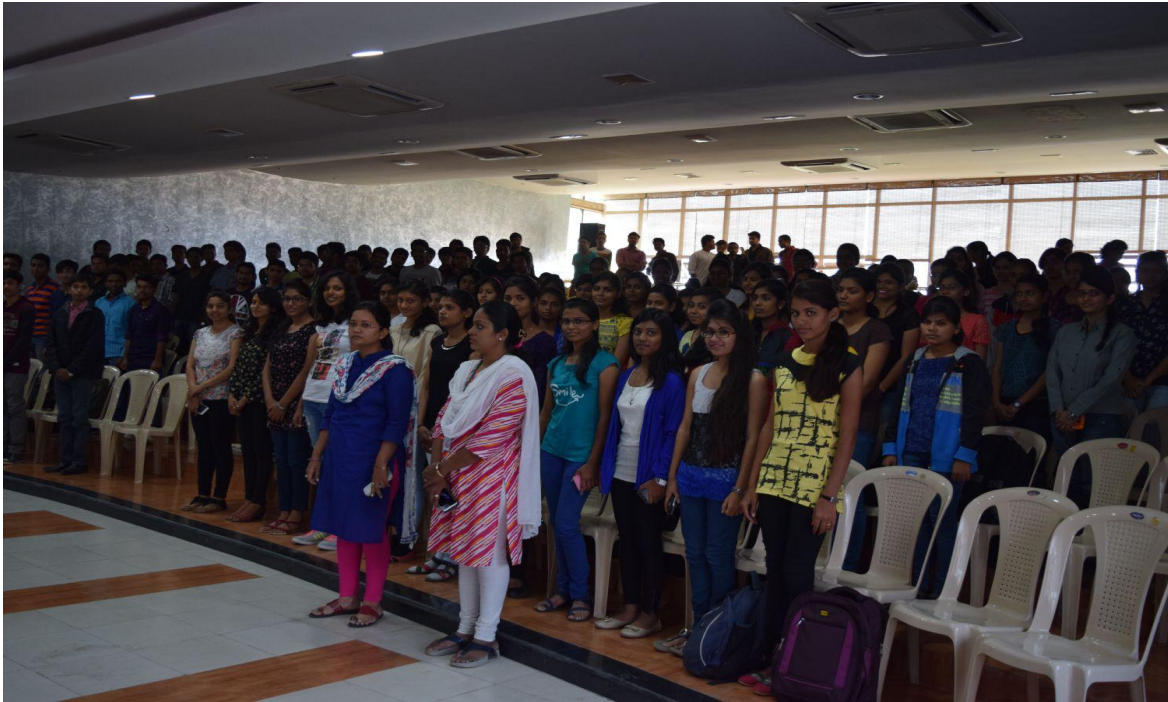
Students observing silence in a common Seminar Hall