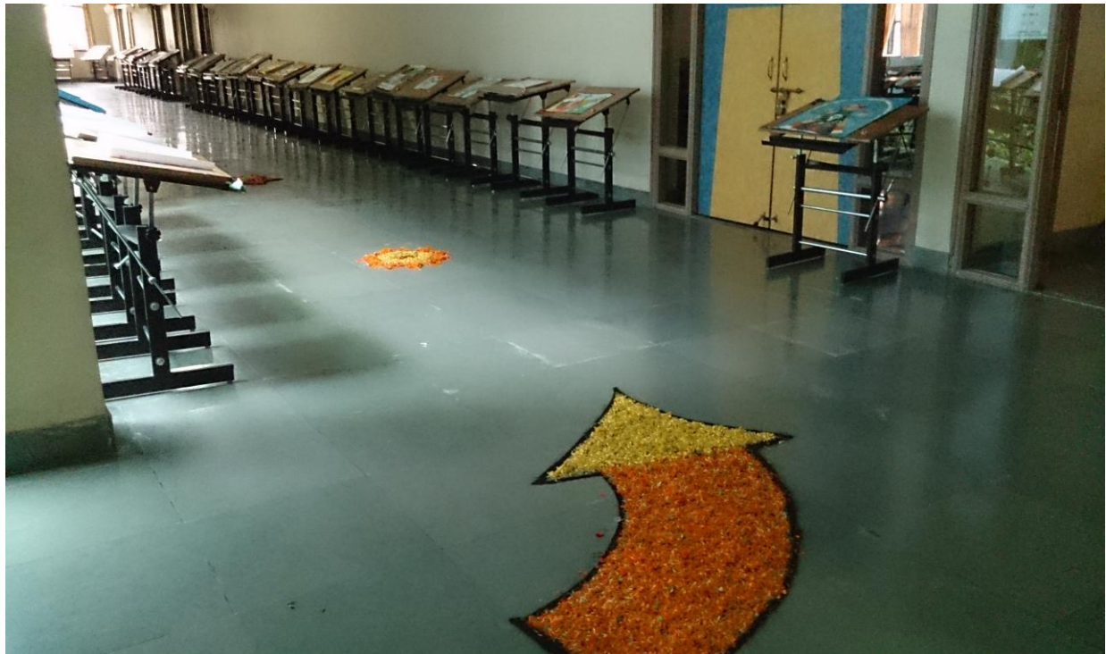
Way Towards Poster Competition