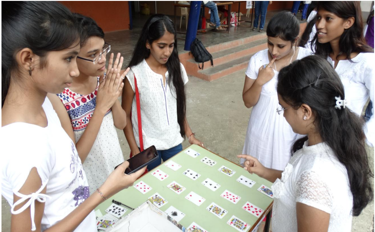
Play to win