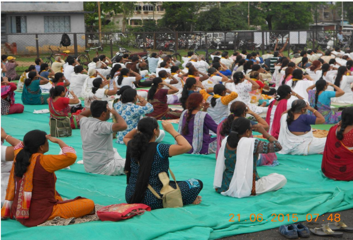
Yoga for harmony & Peace