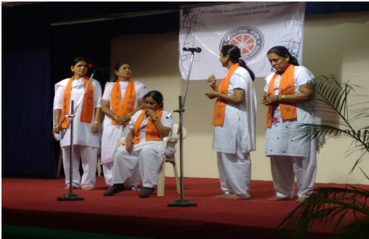
During Awareness Act Play for Eye Donation