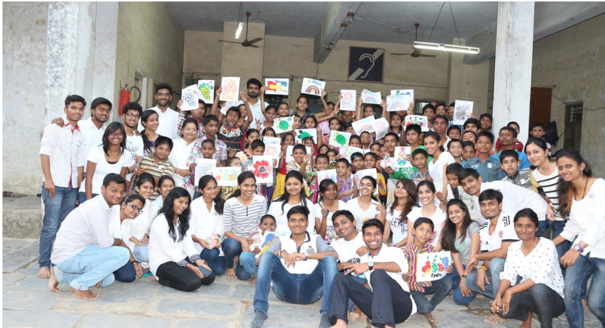
NSS Volunteers had a great time spending with School Children