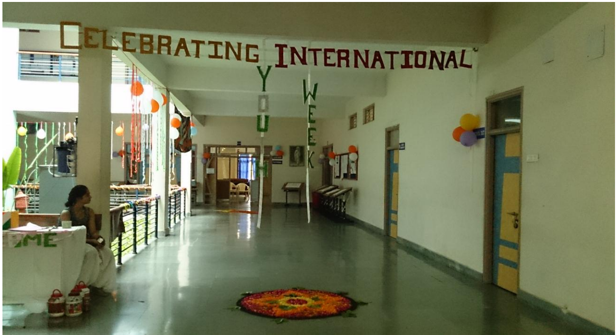
Celebrating International Youth Day – Venue for Poster Competition