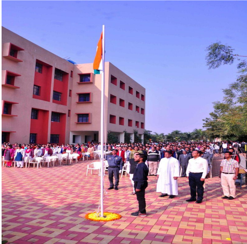
Faculty members & Students during Program