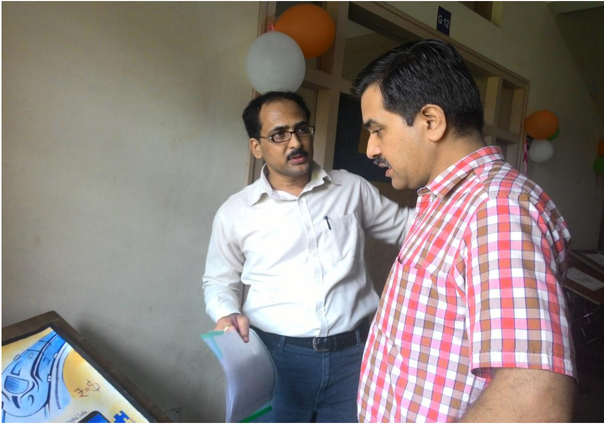
Judges during evaluation