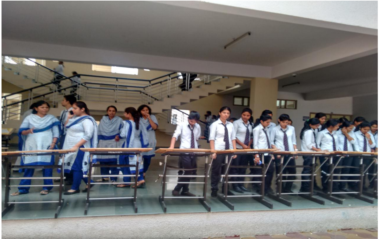
Staff & Students Exploring Poster Exhibition