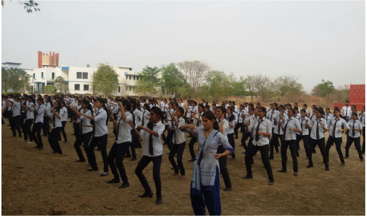
Staff & Students participants during Karate Camp