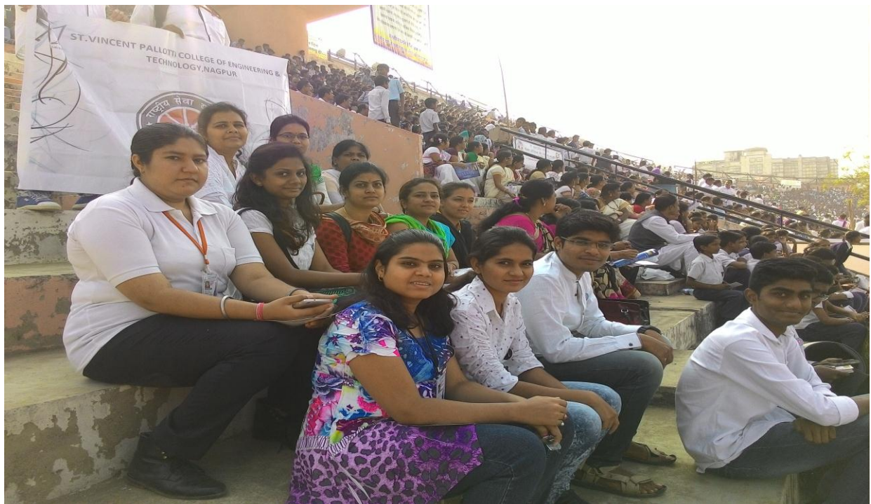
Gathering for Program