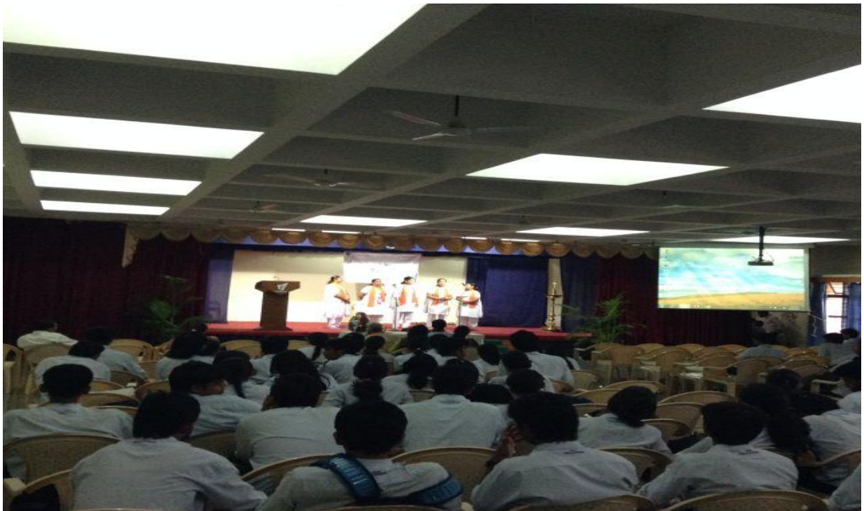
Student Audience paying attention during Act Play