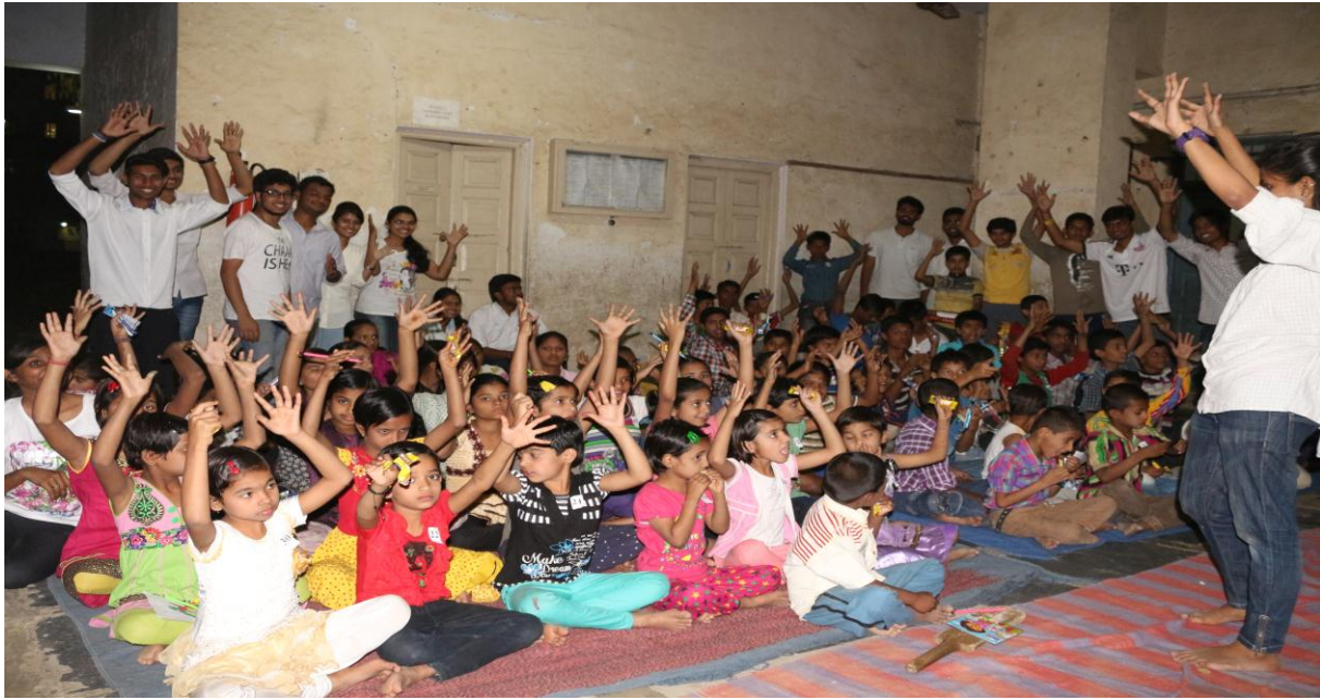
NSS Volunteers along with School Children