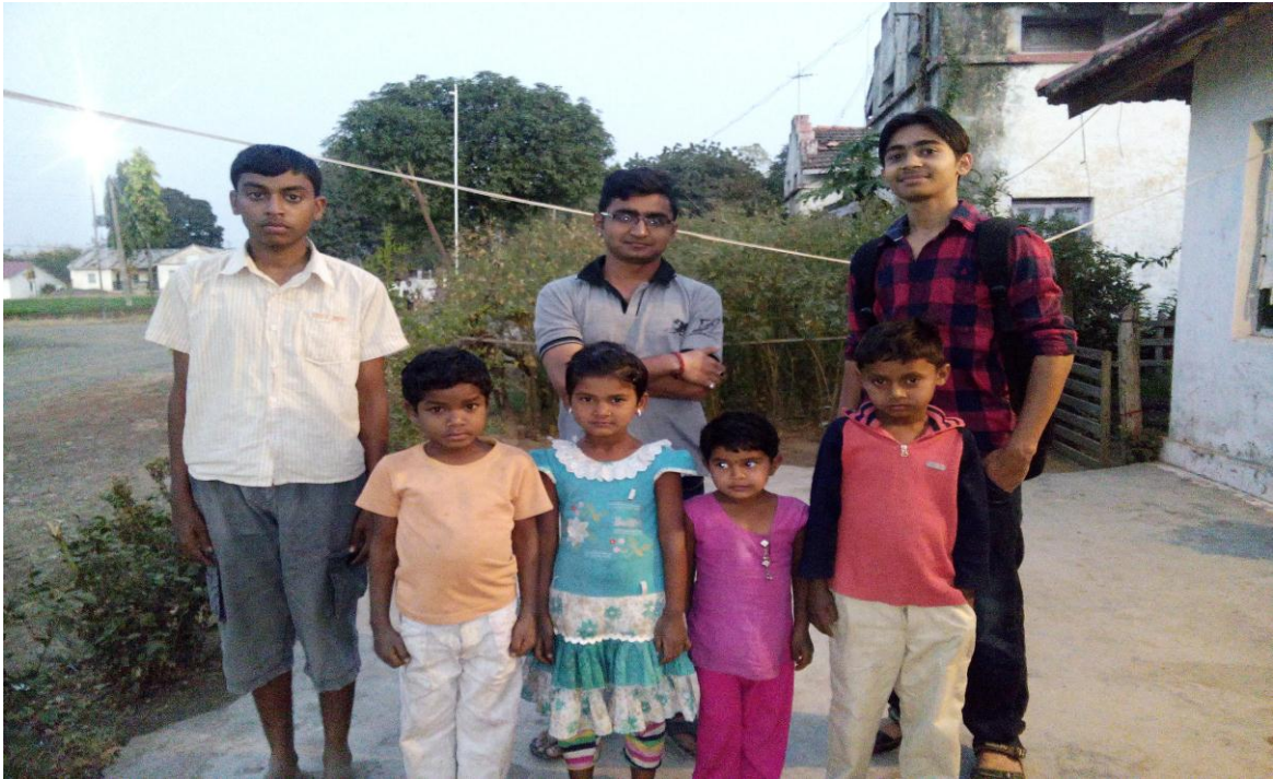
Students done survey at Ashokwan