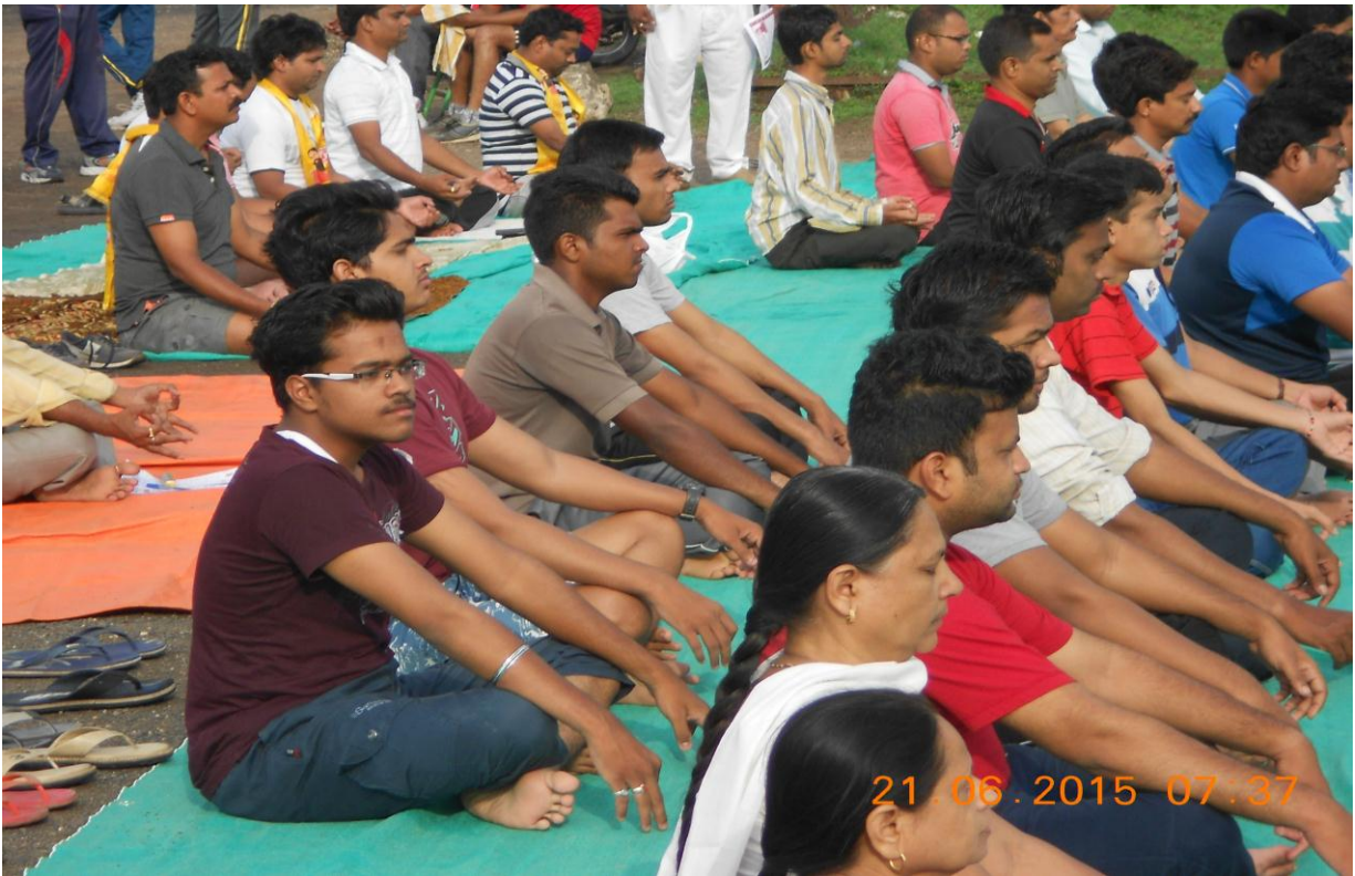
Students Performing Yoga