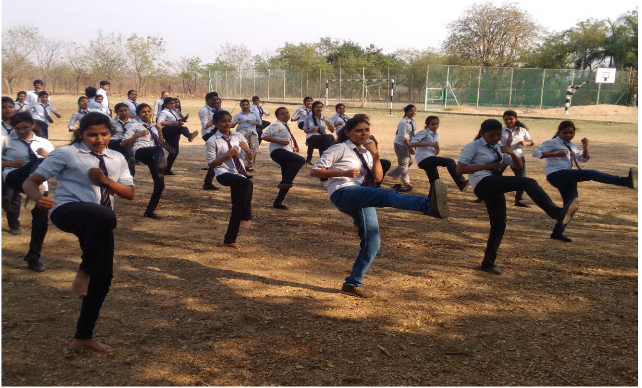
Student participants performing moves