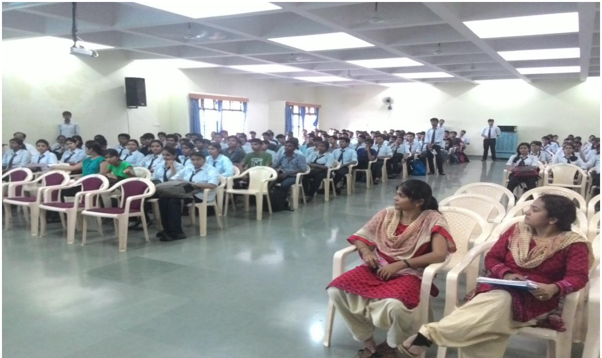
Faculties & Student Audience listening to presentation