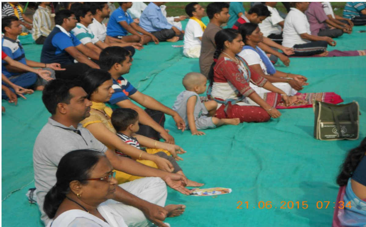
Participant performing Yoga