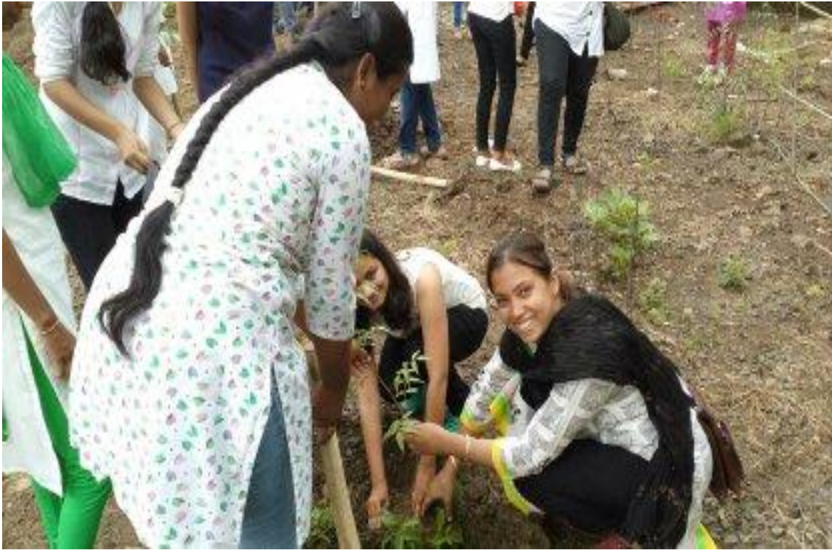
Faculty Coordinator along with student planting sapling