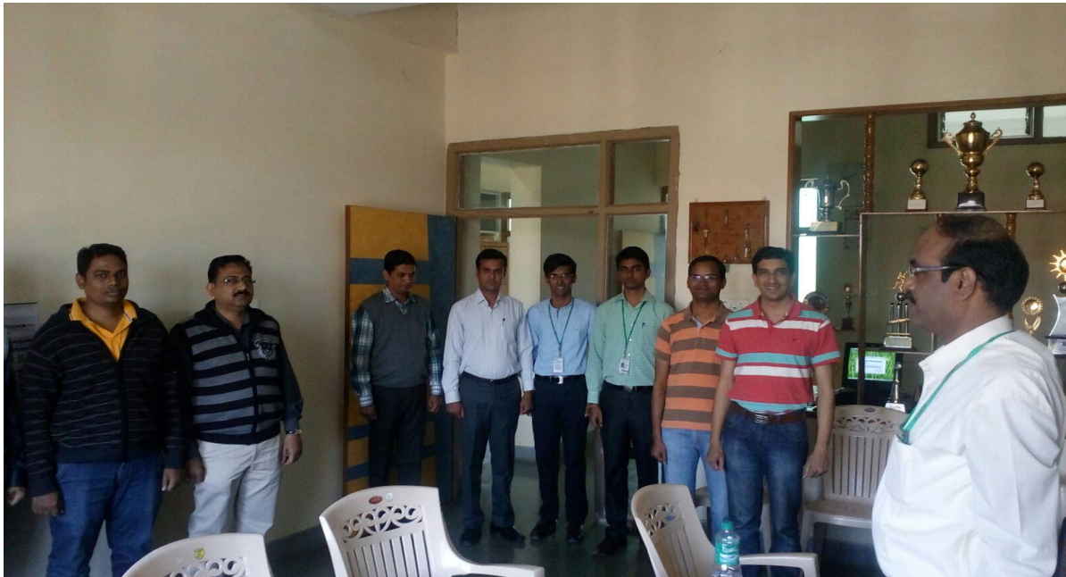
Faculties observing silence in department