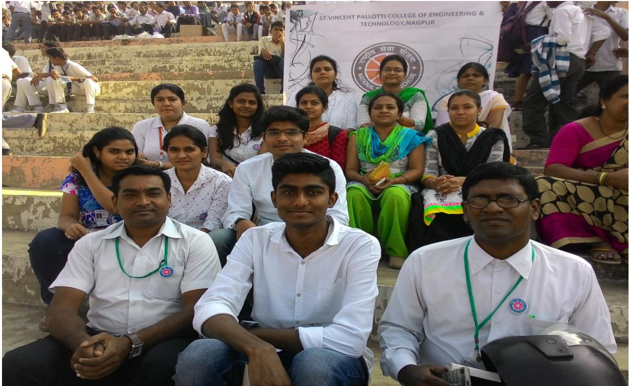
Faculty members & Students during Program