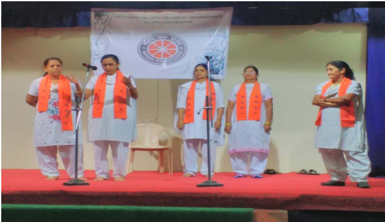
Act Play during Eye Donation Camp for making students aware about