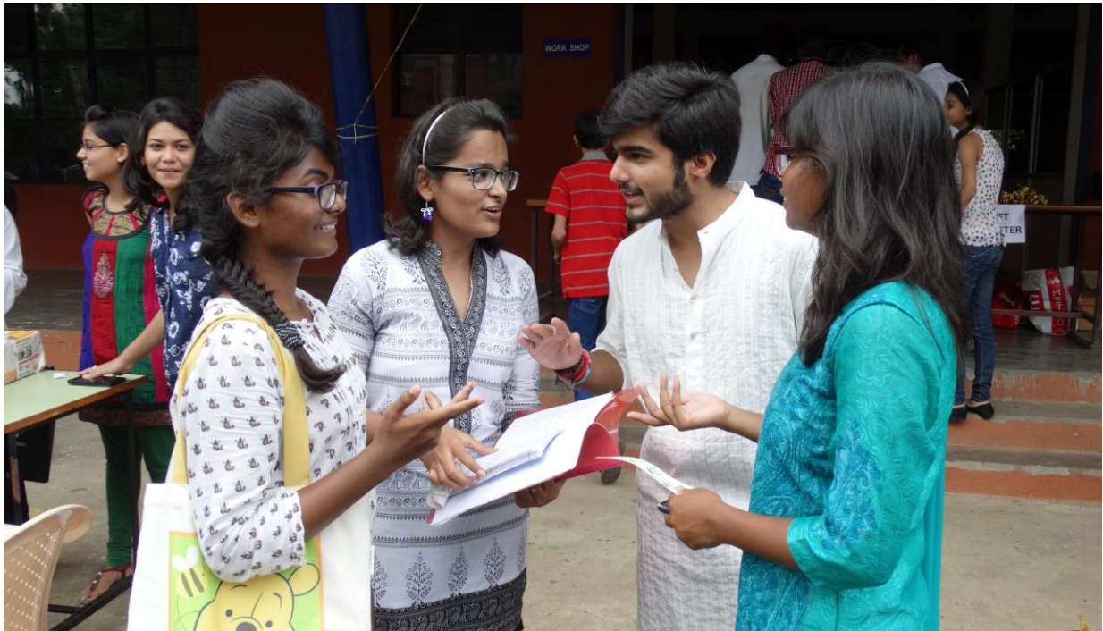
Participants & Organizers during event