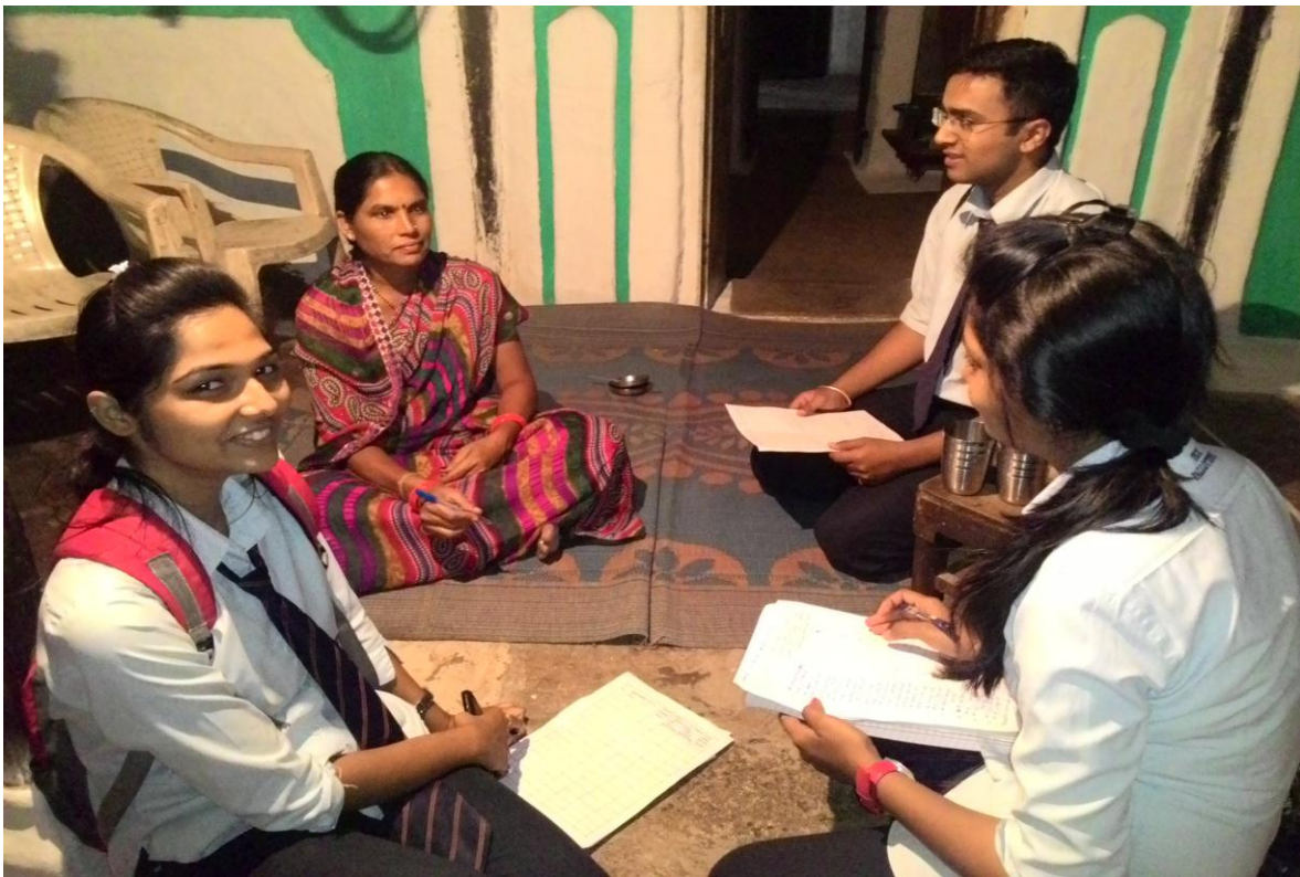
Students Collecting required information for survey (@ Mauja Wela Harishchandra, Dist. Nagpur)