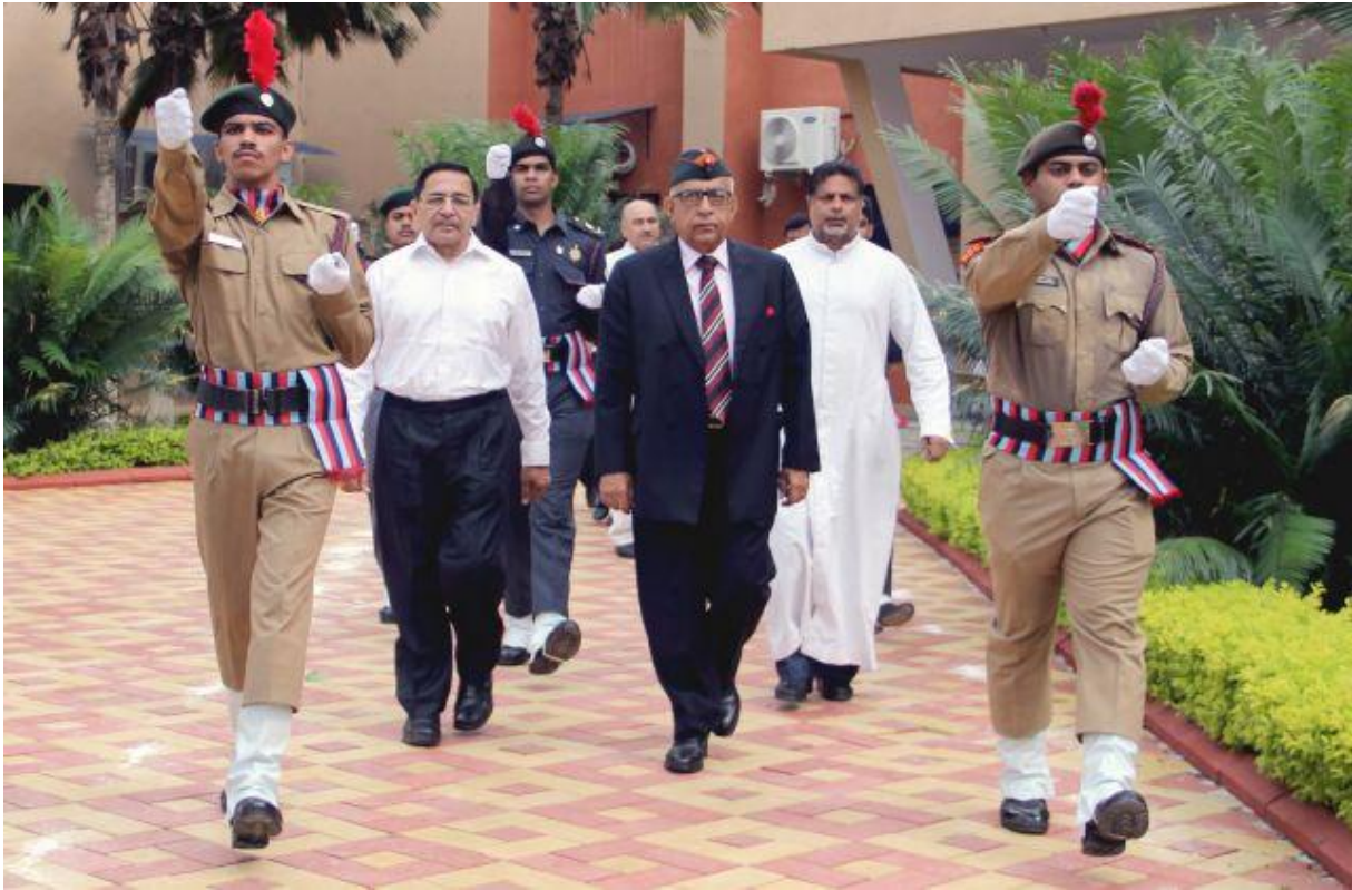
NSS Student Escorting Dignitaries towards Flag Hoisting