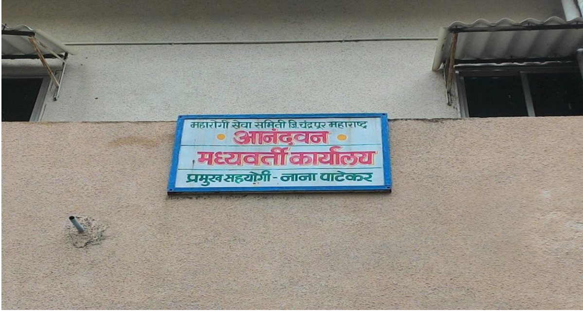
Office of Anandwan, Warora