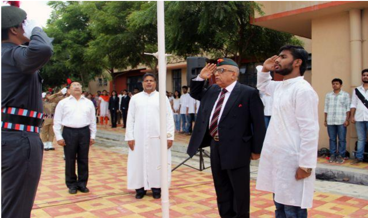
Saluting National Flag after Flag Hoisting