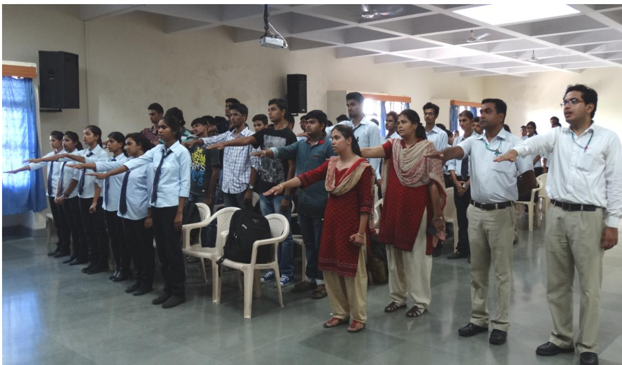
Faculty Members & Students taking Pledge