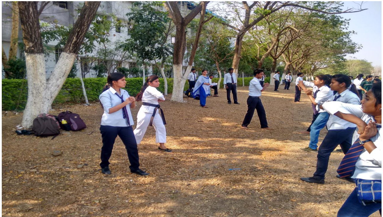
Trainers demonstrating Karate Moves to participants