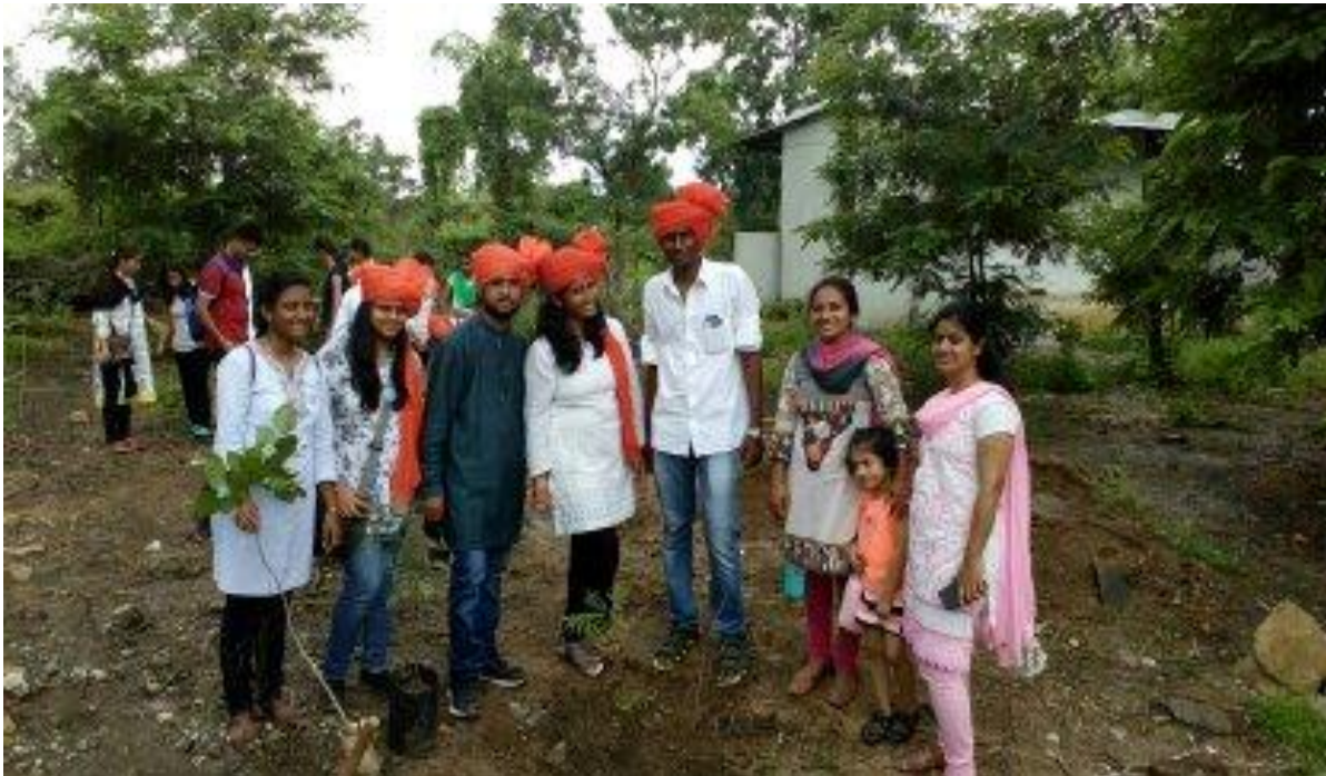
Students during Tree Plantation